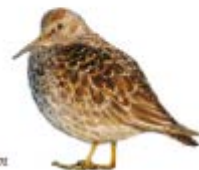
Purple Sandpiper, Jim Fenton